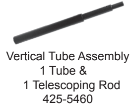
Vertical Tube Assembly 1 Tube & 1 Telescoping Rod 425-5460