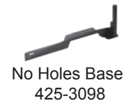
No Holes Base 425-3098