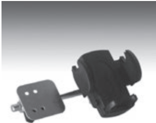
PIVOTING CELL PHONE HOLDER

Specifications subject to change without notice