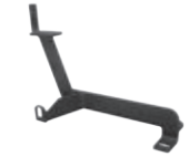
No Holes Base 425-2996