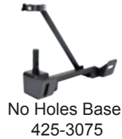
No Holes Base 425-3075