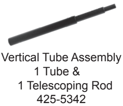
Vertical Tube Assembly 1 Tube & 1 Telescoping Rod 425-5342