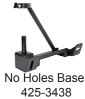
No Holes Base 425-3438